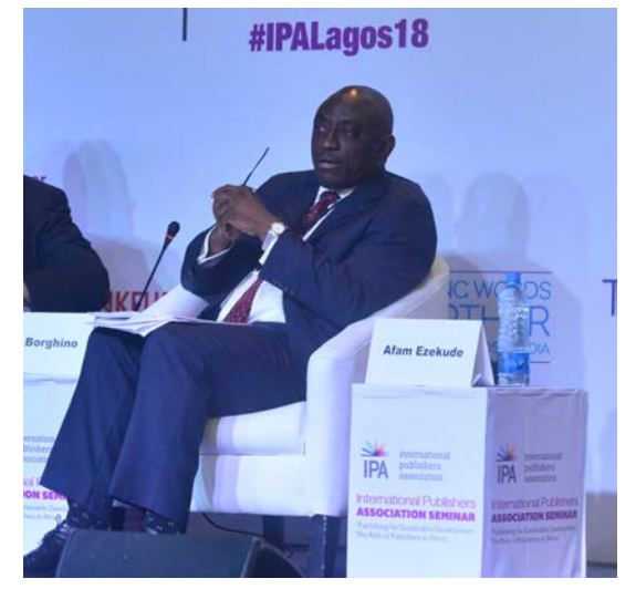
Panel Discussion - 6, speakers Afam Ezekude, Director General, Nigeria Copyright Commission discusses government intervention on piracy.

He said that between 30 and 50% of books used in secondary schools are pirated and he asked three questions: Are the legal provisions against piracy adequate? Are booksellers themselves ethical? How can the industry protect itself against pirated books coming from outside the country?