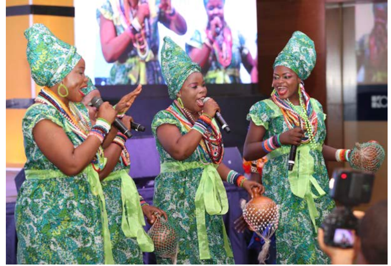
Adunni & Nefertiti Band performing during the gala dinner.

The Seminar ended with African singing, drumming and dancing, courtesy of Nigerian vocal and dance troupe Adunni & Nefertiti who describe themselves as folksong ambassadors, keeping alive music that appeals across language and ethnic barriers. They gathered various members of the audience to join in the dancing which made for a joyous end to a stimulating day.